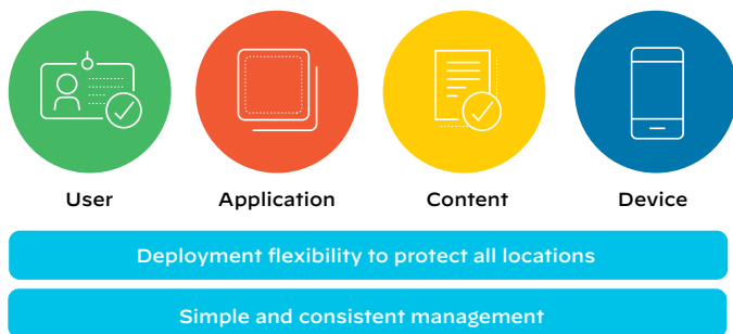
Figure 1: Core elements of network security

Our Next-Generation Firewalls inspect all traffic, including all applications, threats, and content, and tie that traffic to the user, regardless of location or device type. The user, application, and content—the elements that run your business—become integral components of your enterprise security policy. As a result, you can align security with your business policies as well as write rules that are easy to understand and maintain.